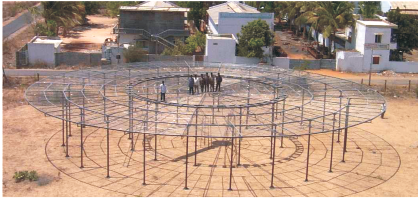
The Counterpoise Earth System for DVOR is arranged for high accuracy communication at the difficult sites since it is immune to many of the siting problems and gives the required tolerances for the signals in space.